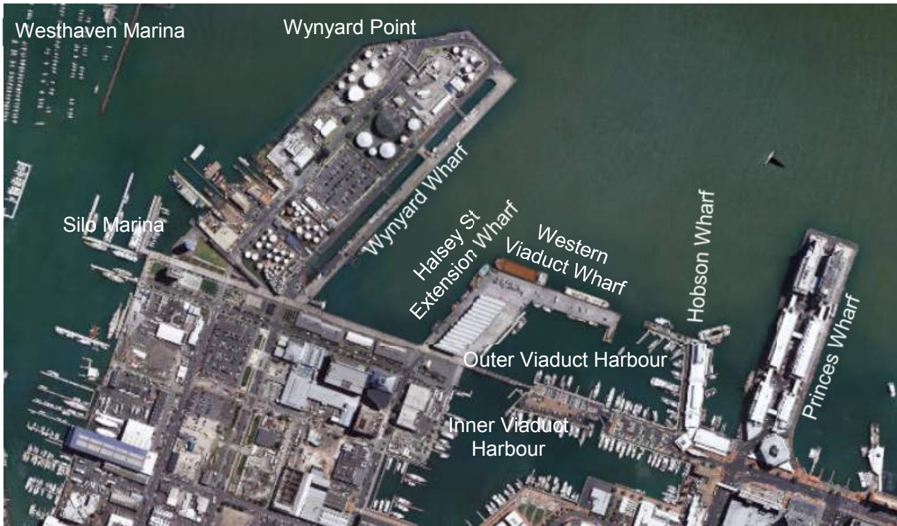
Figure 1-1: Existing Wharves and Marinas

Existing wharves and marinas are shown in Figure 1-1 and on Civil Drawing 1.